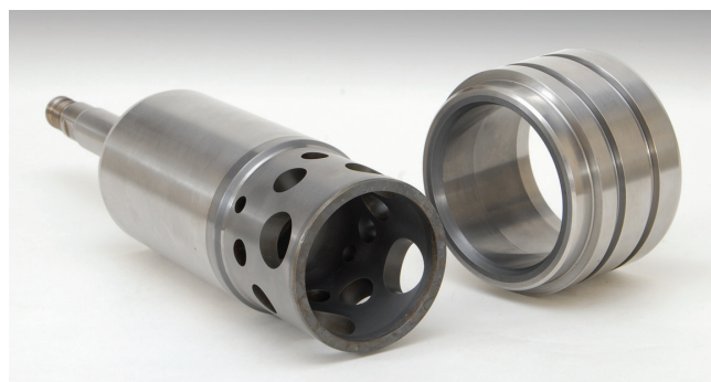
A practical application for an improved fastening technique such as GenFixx is pictured above.

Another significant benefit GenFixx offers is verification of joint integrity with the naked eye. With GenFixx, you never need to assume that an operator has performed a successful braze that can withstand the harshest conditions. When it comes to severe service valve applications, GenFixx has the advantage because undetectable is undesirable.